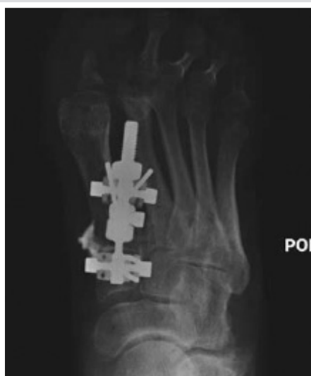
Picture 2. Percutaneous delivery of CERAMENT™ was accomplished at the metatarsal delayed union site