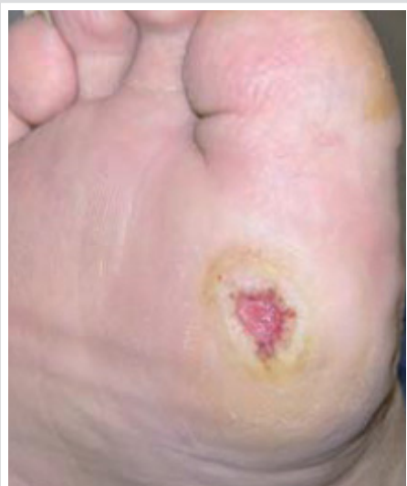
Picture 1. Chronic diabetic foot ulcer at a prominent first metatarsal head.